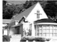
St Anthony's Church Seatoun